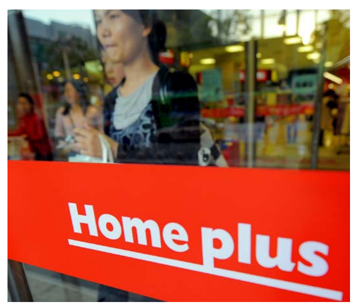
The buyout of Korea's Homeplus used mezzanine

Capital and MBK Partners for HK$9.5 billion ($1.22 billion), as well as Permira's purchase of business services firm Tricor